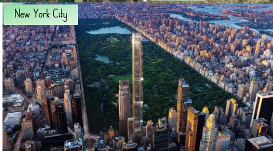
New York City